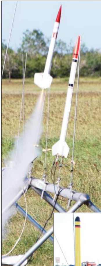
Rockets launch and prepare to launch at the South Texas Aerospace Club's night rocket launch last Saturday. Wastequip, who helped sponsor the event, took a trainers class the day before to be able to hold a prep and fly event. The prep and fly event helped assist kids and teach them how to fire their own rockets. Close to 50 kids, ranging from ages 3-17, were able to command their very own blast off for the first time.